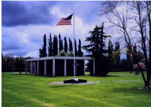
Freedom Lawn Veteran's Garden & Garden Mausoleum